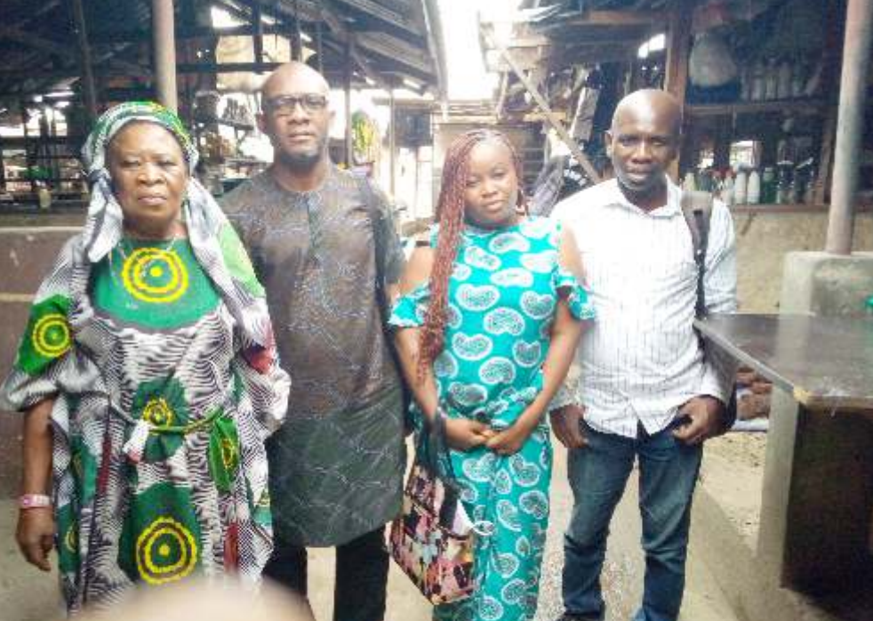
NANTS Leader in Borokiri Road Market and members of the Rivers State Tax Justice & Governance Platform – Advocacy engagement on Tax for Service & ending illegal and multiple taxation and levies campaign.

WITH SUPPORT FROM CIVIL SOCIETY LEGISLATIVE ADVOCACY CENTER (CISLAC) AND FUNDING FROM OXFAM IN NIGERIA.