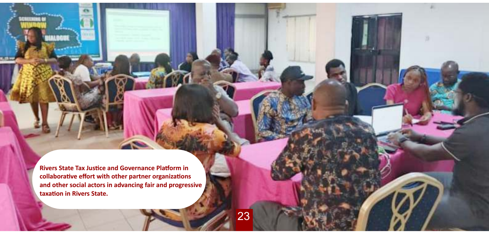
Rivers State Tax Justice and Governance Platform in collaborative effort with other partner organizations and other social actors in advancing fair and progressive taxation in Rivers State.