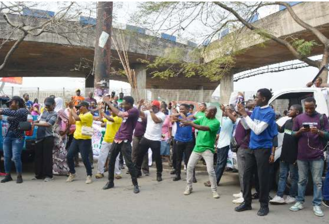
Members of the Rivers State Tax Justice and Governance Platform and diverse social actors at the first Tax Walkathon to raise awareness in recent times.