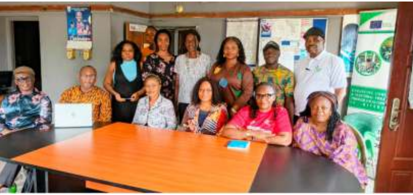
Members of Rivers State Tax Justice and Governance Platform at a Peer-review/Learning session