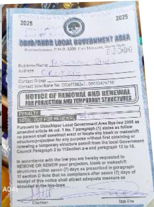
Fig 2: Local Government Demand notice