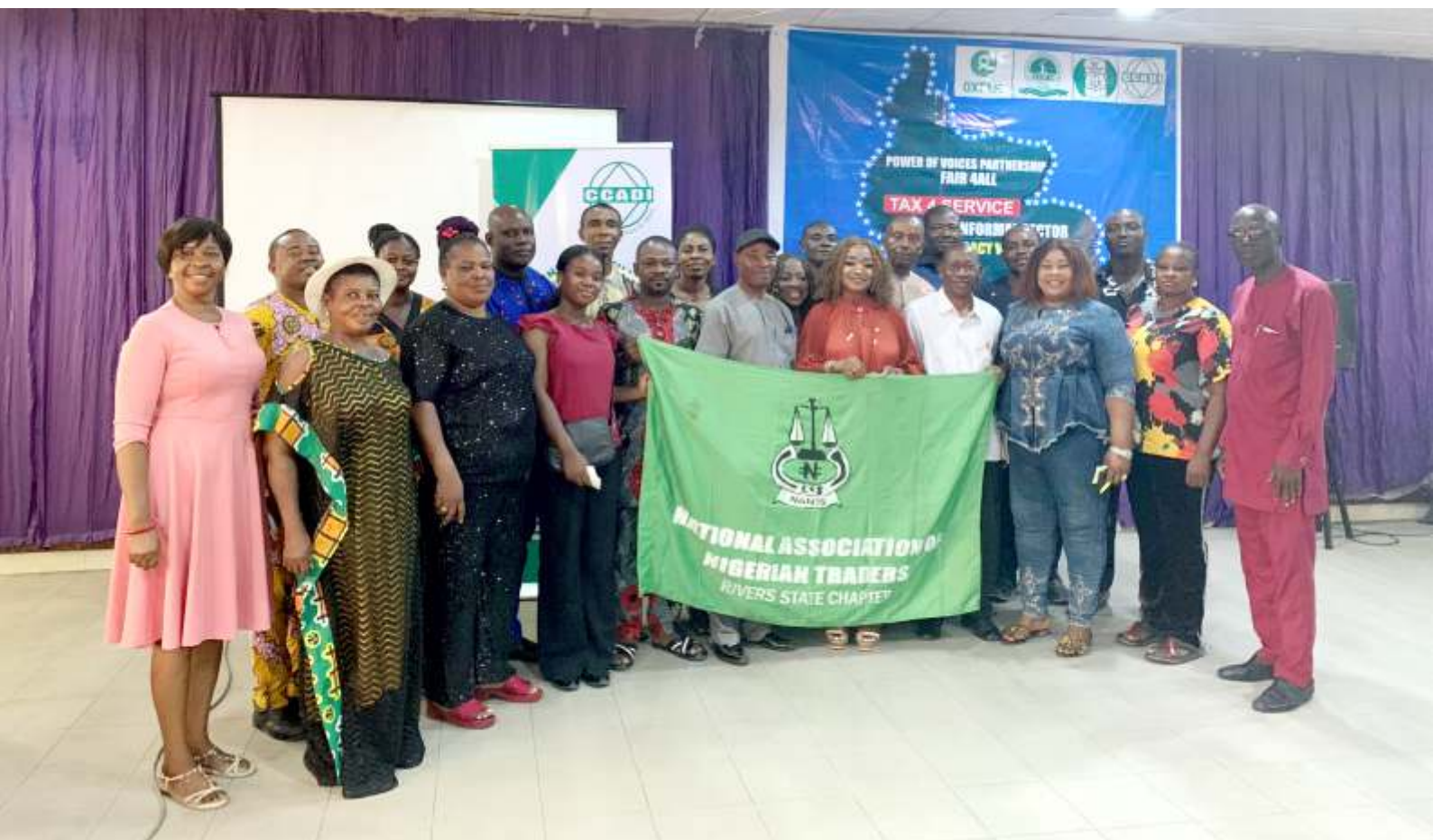
Members of the National Association of Nigeria Traders (NANTS) after a capacity building Write-shop on strategic advocacy in Port Harcourt, Rivers State.