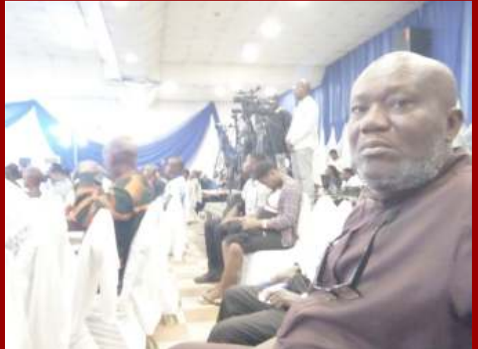
At the Rivers State 2023 Governorship Debate – FCDO delegation, ActionAid Nigeria & Members of Rivers State Tax Justice & Governance Platform in Port Harcourt, Rivers State.