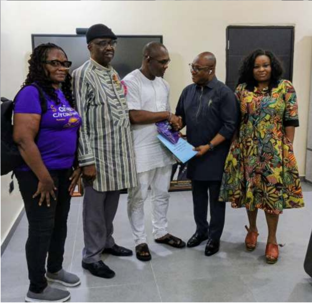
6/11/25: Pictures: The Rivers State Tax Justice and Governance Platform team with the Executive Chairman, Rivers State Board of Internal Revenue