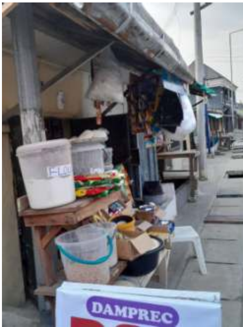
Fig 1: A session of the provision shops