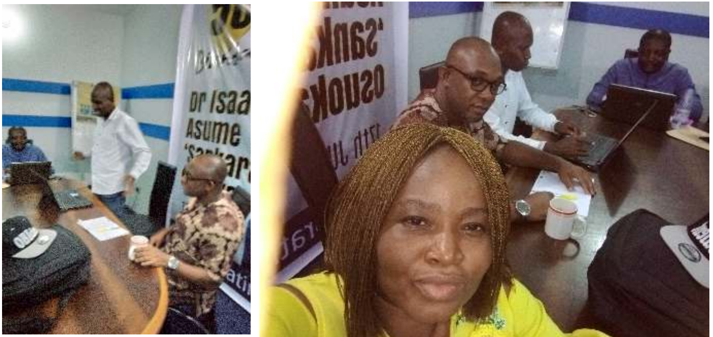
Rivers State Tax Justice & Governance Platform members brainstorming at a planning meeting.

(c) Rivers State Tax Justice and Governance Platform held a virtual write-shop on the 6 th of September, 2022, on the development of advocacy strategy brief to enable members acquire knowledge and skills on how to develop an advocacy strategy plan and to keep the platform focused on the objectives we have committed to achieving. At the end of the virtual write-shop, most members demonstrated understanding and capacity to draw up a fair and progressive tax advocacy plan for their various organisations. About 12-member organisations participated in the virtual write-shop (Creative Development Strategies, Gender and Development Action, Support Initiative for Sustainable Development, Global Peace Development, Jamessira Centre for Development, Ofure Centre for Peace and Development, Canaan Peace Women & Community Development Initiative, Collaborative Living and Development Initiative and Centre for Human Rights, Health, Ethnic Harmony & Livelihood Development).