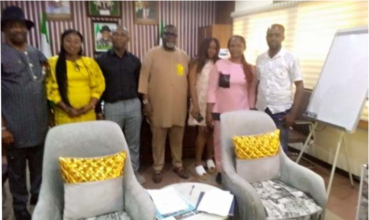
Advocacy visit to state actor- Hon. Commissioner of Local Government Affairs on digitizing revenue collection at the third tier of government in Rivers State, Nigeria.

Advocacy visit to state actor- Hon. Commissioner of Local Government Affairs on digitizing revenue collection at the third tier of government