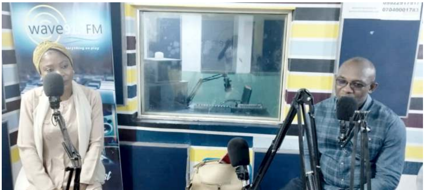
The Rivers State Officer of Small and Medium Enterprises Development Agency of Nigeria (SMEDAN) & the Rivers State Coordinator of Tax Justice and Governance Platform.