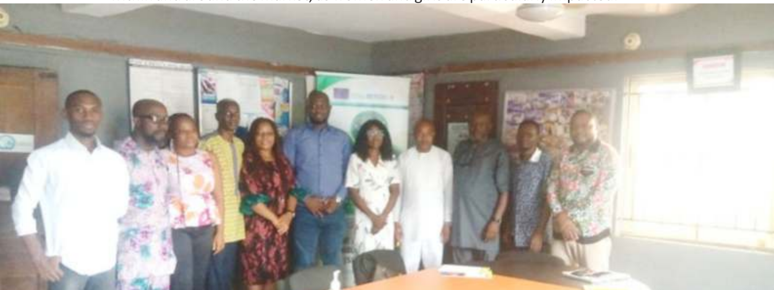
USAID Team in a focus group discussion on safeguarding the civic space and personal security of members of the Rivers State Tax Justice & Governance Platform.