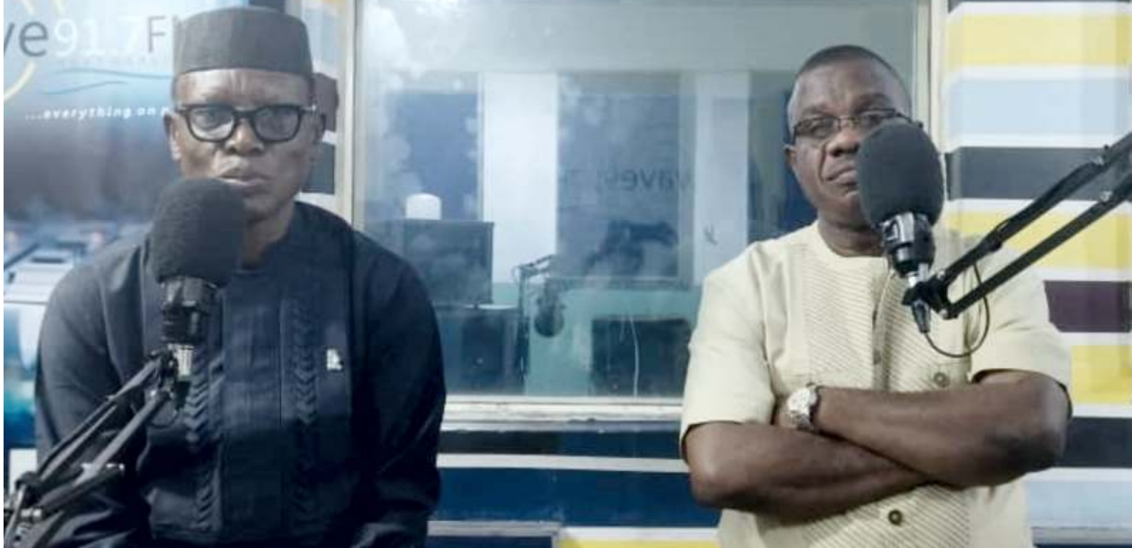
The Rivers and Bayelsa States Chairman of the Manufacturers Association and an Officer discussing tax matters on the “Tax Watch Radio Talk Show.

WITH SUPPORT FROM CIVIL SOCIETY LEGISLATIVE ADVOCACY CENTER (CISLAC) AND FUNDING FROM OXFAM IN NIGERIA.