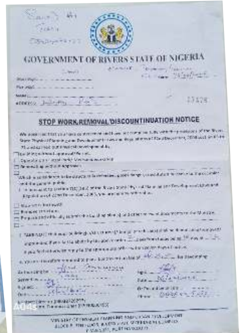
Fig 3: Rivers State Government, Ministry of Physical Planning and Urban Development Demand notice