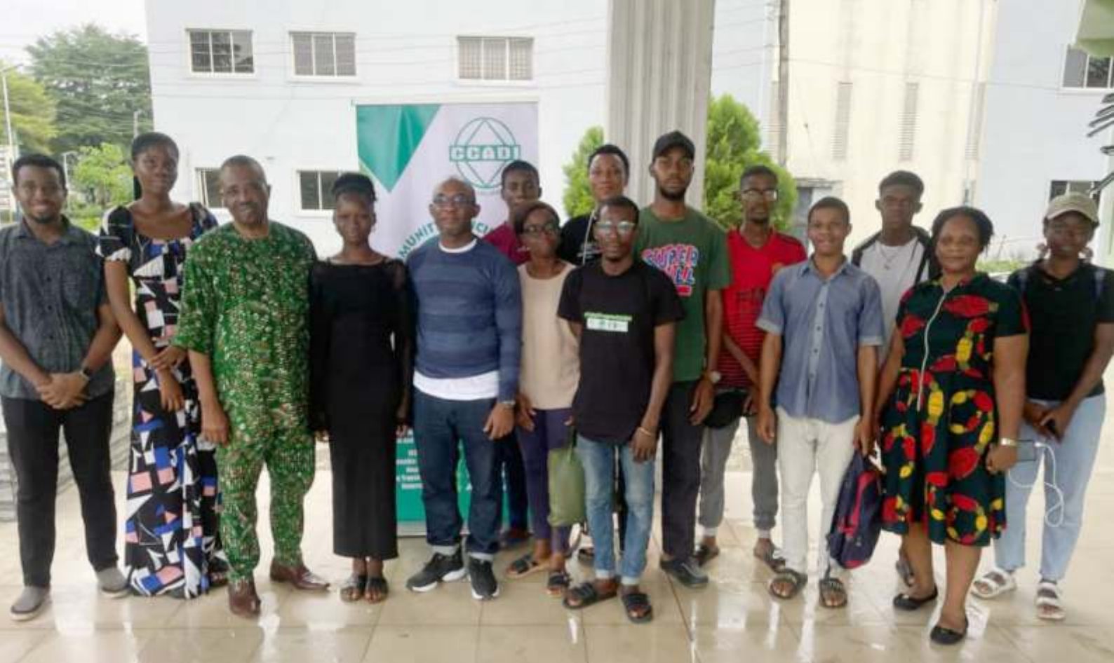
Members of the Rivers State Tax Justice and Governance Platform and Members of the University of Port Harcourt Tax Club after a mentoring session at the University Campus, Port Harcourt, Rivers State.