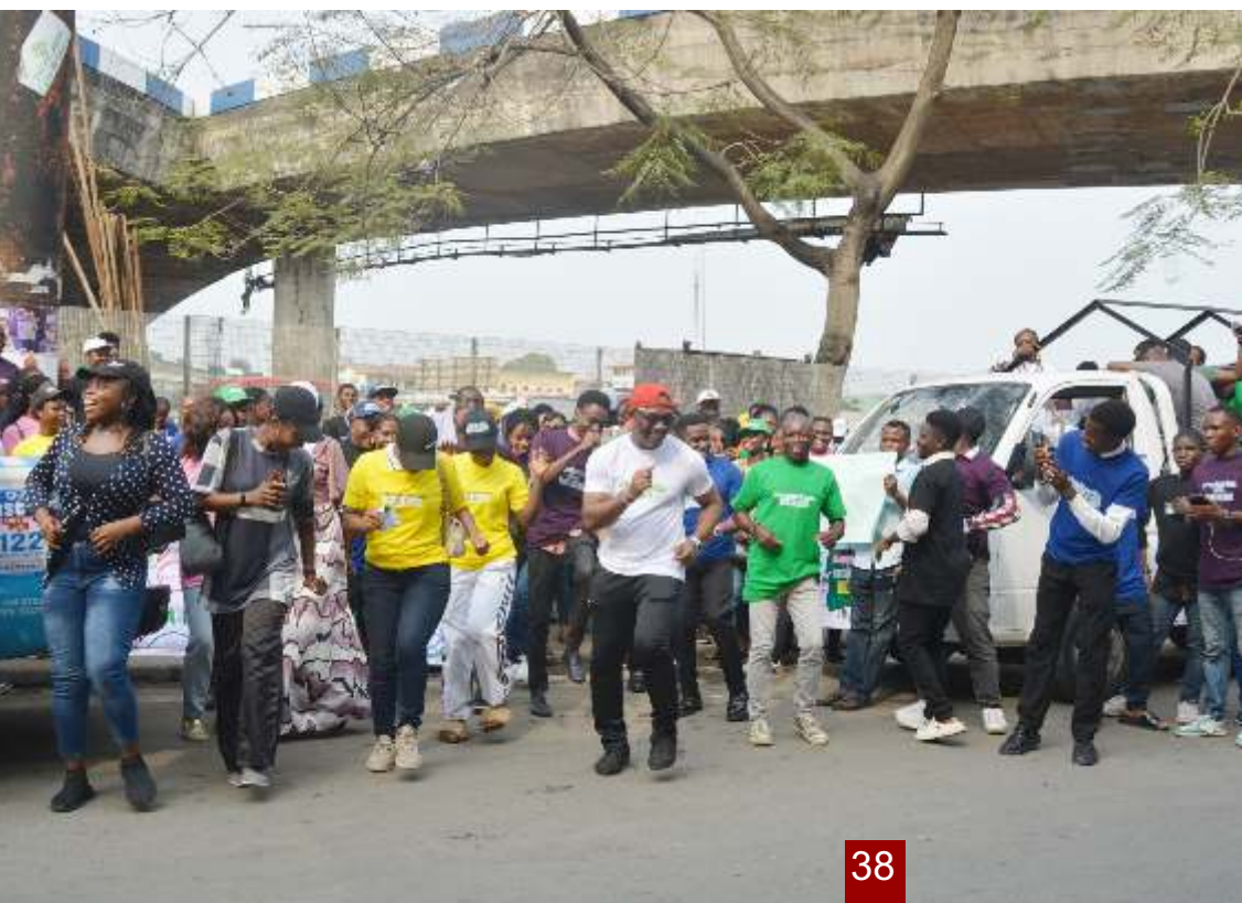
Members of the Rivers State Tax Justice and Governance Platform and diverse social actors at the first Tax Walkathon to raise awareness in recent times.