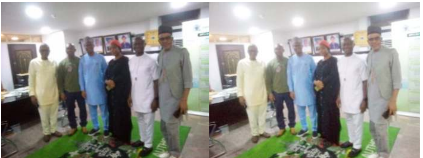
Members of the Rivers State Tax Justice and Governance Platform, SMEDAN, NASME & Ministry Commerce with the Calabar Seaport Manager on a regional advocacy engagement to improve regional trade and tax administration held in Calabar.