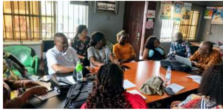
Members of Rivers State Tax Justice and Governance Platform at a Peer-review/Learning session